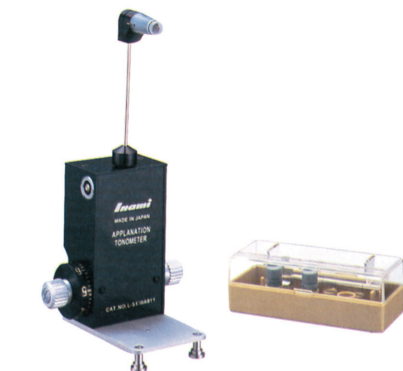
L-5110 / L-5130 contains 2 cone prisms.

L-5130 can be placed on the guide plate in one of two possible positions. These positions are connected with the microscope, for observation can be made either through the right or the left eyepiece.