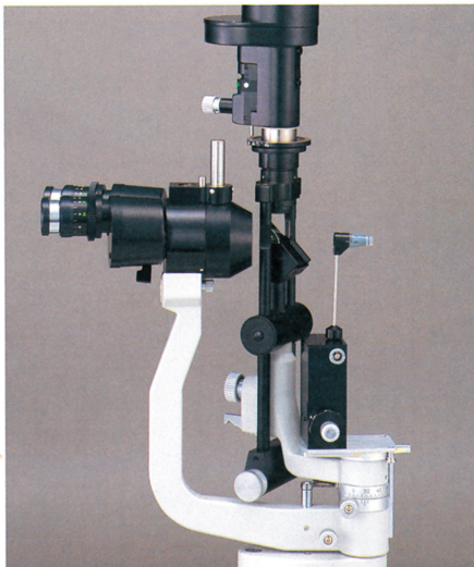
L-5130 (Plate type) mounted on INAMI Slit lamp

When the tonometer is in use it can be swung forward just in front of the microscope and exact centering of the prism with the left eyepiece is engaged by notch. Illumination through the built-in cobalt filter projected to the plastic measuring prism for flattening the vertex of cornea gives reflection-free observation of split images.